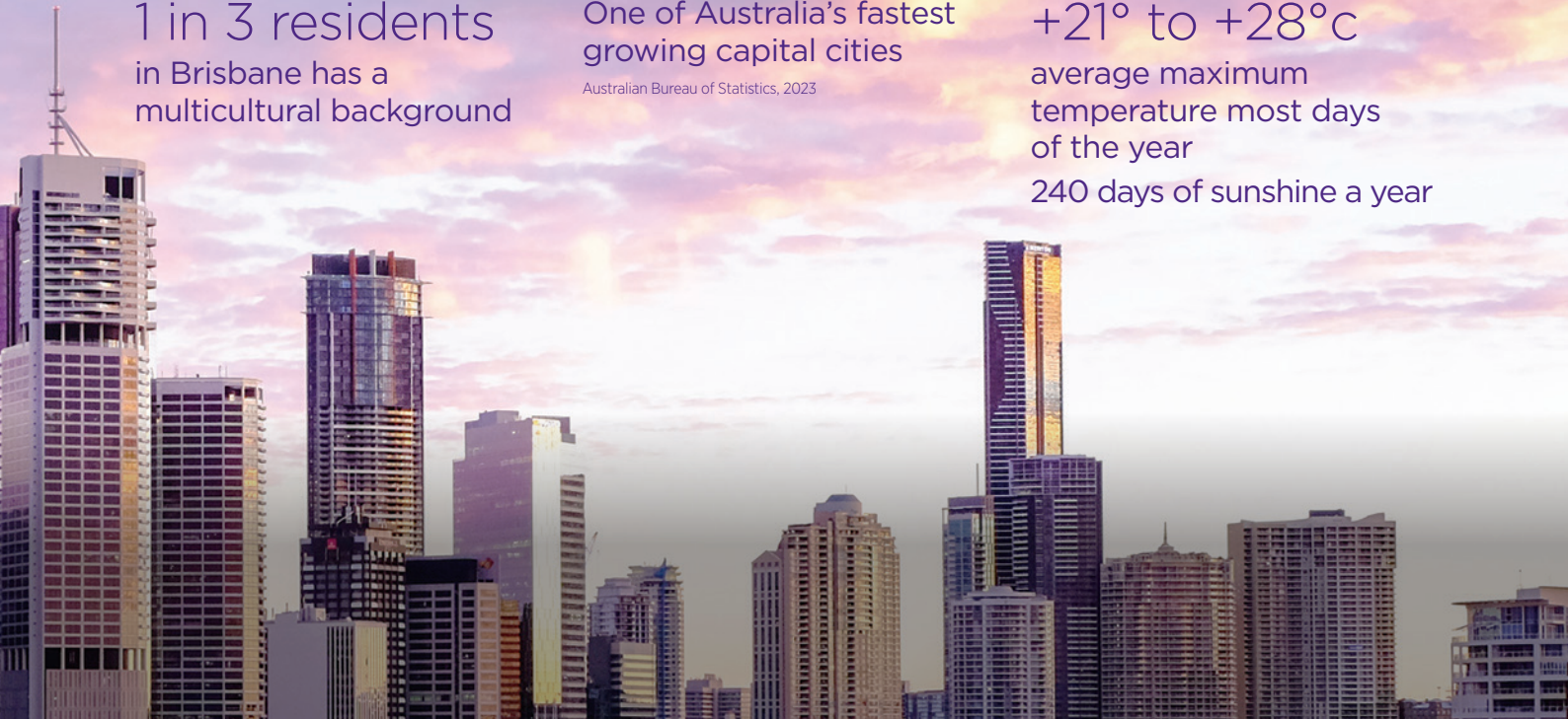
Brisbane's city centre by the Brisbane River.

+21° to +28°C average maximum temperature most days of the year 240 days of sunshine a year