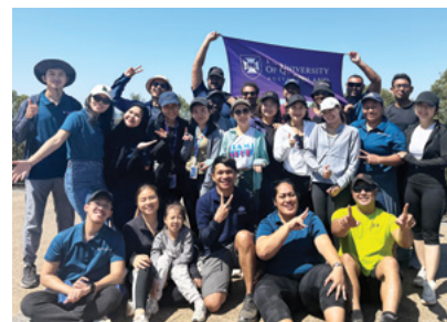
Hiking at Mount Coot Tha

The society was established to offer Australia Awards Scholars at UQ a dedicated platform to connect, share, and learn from each other's diverse cultural backgrounds, including Australian culture, both socially and professionally. By fostering a strong sense of belonging, UQSAAS plays a key role in supporting the personal and academic success of scholars. It creates opportunities for leadership, cultural exchange, and collaboration, enhancing the overall student experience and building lasting networks that extend far beyond university life.