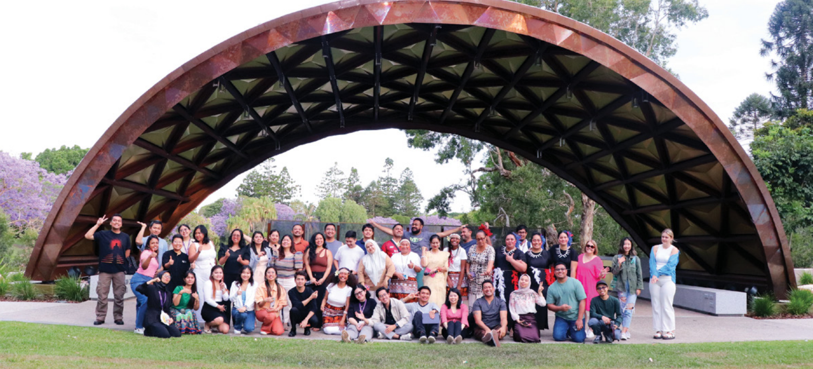
Cultural and Music Festival